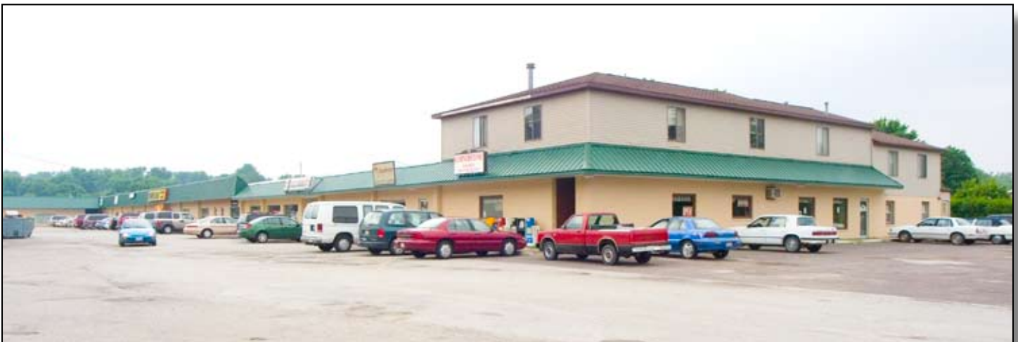
Lakeview Shopping Center

Location: Rt. 117 south edge of Eureka ✨